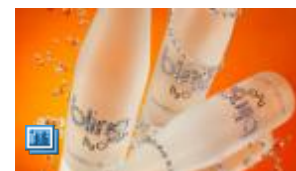
Five weird and pricey bottles of water