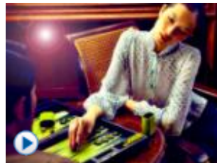
The Bling Dynasty: How China shops