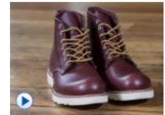
The hot new fashion hub? Minnesota