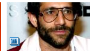
Company founders who fell from grace