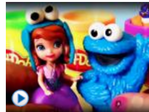
YouTube's highest paid star does what?