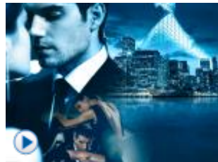
Most absurd '50 Shades' product