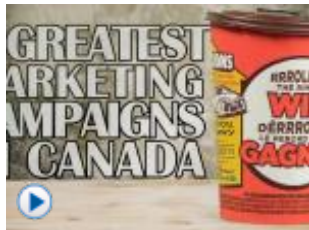
5 greatest ever marketing campaigns