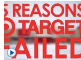
The 5 reasons Target failed in Canada